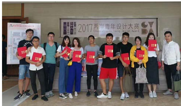
Fig.3. Introducing Competition Items into Teaching