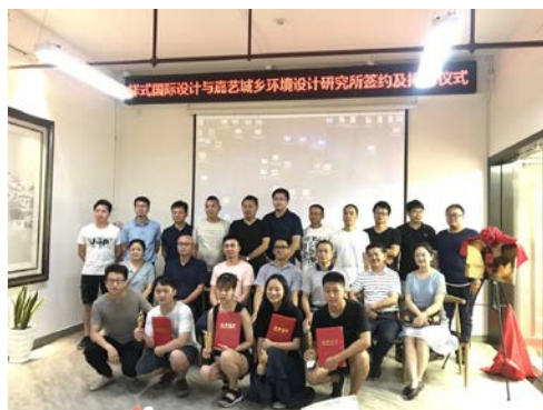
Fig.4. Co-construction Institute