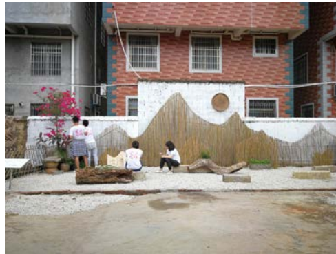
Fig.2. Construction and Implementation of Student Site